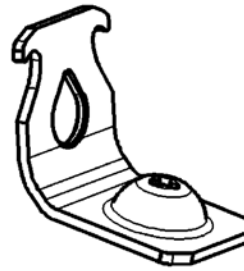
FIGURE 1B—HILTI X-CX CEILING CLIP