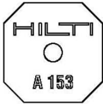
FIGURE 4—HILTI X-CP WASHER