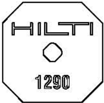
FIGURE 3—HILTI X-CF WASHER