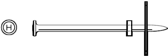
FIGURE 1—HILTI X-CF SILL PLATE FASTENER

7 Minimum fastener spacing must be 4 inches on center or must comply with Section 12.1.6 of the NDS to prevent splitting of the wood.