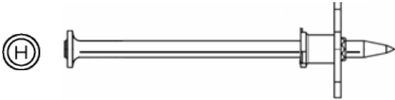
FIGURE 2—HILTI X-CP SILL PLATE FASTENER